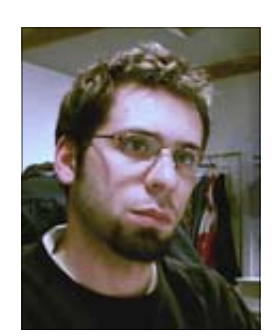
By Alexander Krstevski

The members of the first U.N. Human Rights Council were elected by the General Assembly yesterday, May 9<sup>th</sup>. The new 47-seat body replaces the now defunct U.N. Human Rights Commission. The creation of the new body is the result of widespread dissatisfaction with the former commission for allowing seats to countries with questionable