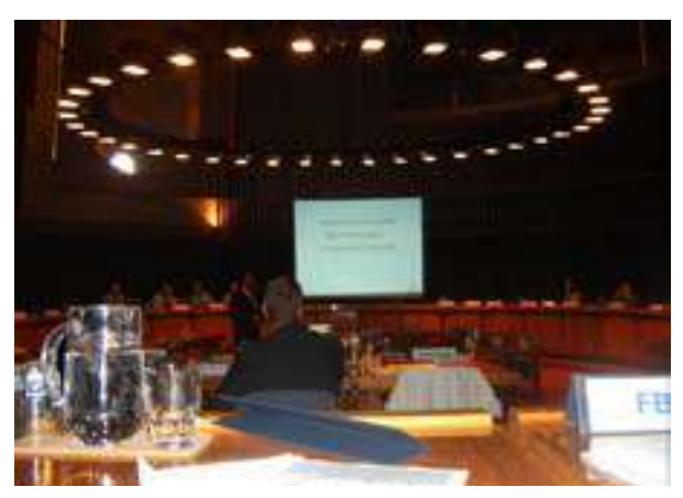
ECLAC Regional Implementation Meeting